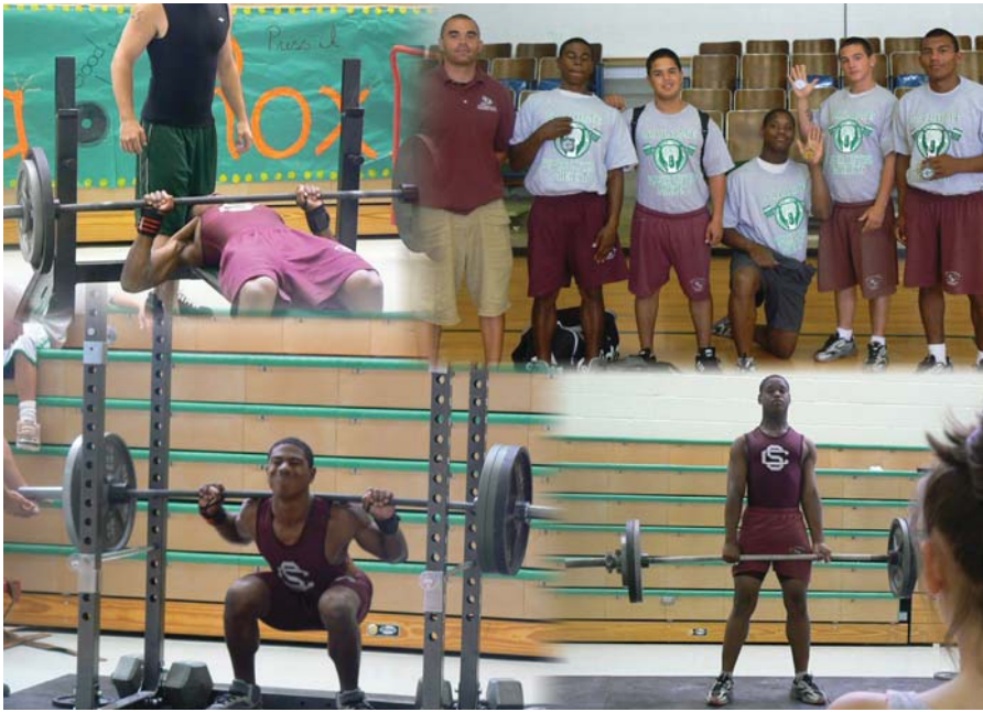
The Rams have a strong powerlifting team.

Its one thing we do to get our kids to realize that everyone is equal, no matter where you're from or what you've been through.