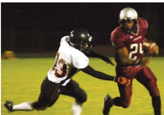
The Rams football team has won back-to-back state championships.